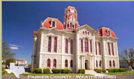
PARKER COUNTY - WEATHERFORD